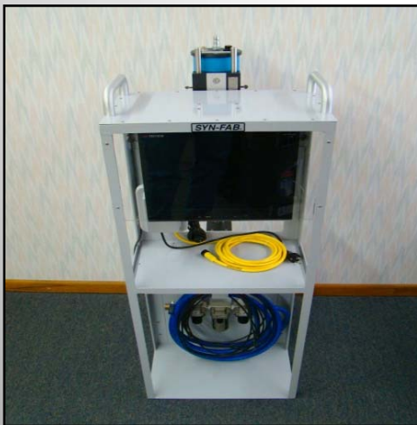
SAM0038 PORTABLE CART ASSEMBLY